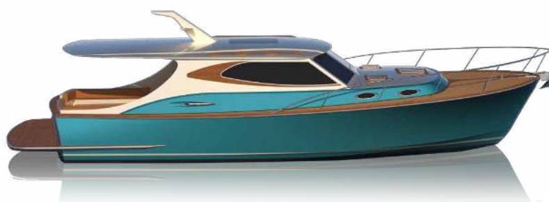
Extended Roofline Option